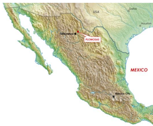
Figure 1. Location of Plomosas mine, Mexico

Details of the drilling results were previously released to the market as the program progressed but results from LV5040 (4.5m at 36.5% Zn, 0.76% Pb) were particularly exciting as they represent the first significant high-grade target extending the Tres Amigos mineralised horizon up to 120 metres down dip within the Juarez Limestone (Figure 2).