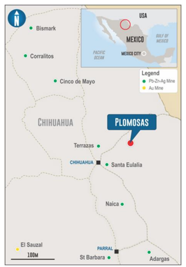
Figure 1. Location plan of Plomosas mine within the Chihuahua zinc-lead geological belt and Santa Eulalia concentrator.

The decline bypass, detouring around the zig zag bottleneck in the decline, has commenced and will be completed in the December quarter allowing for reduced haulage cycle times, improving both productivity and production.