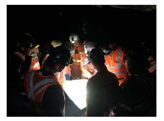
Figure 3. CZL's mining team planning the recommissioning of the Plomosas mine