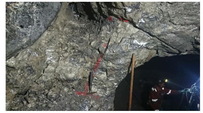
Figure 4. Tres Amigos high grade ore exposed in stope 1000. Note the hanging wall contact in the top left corner of plate with low grade running >5% Zinc.